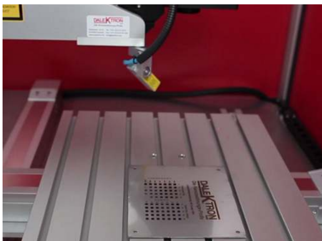
Mark metal signs with laser